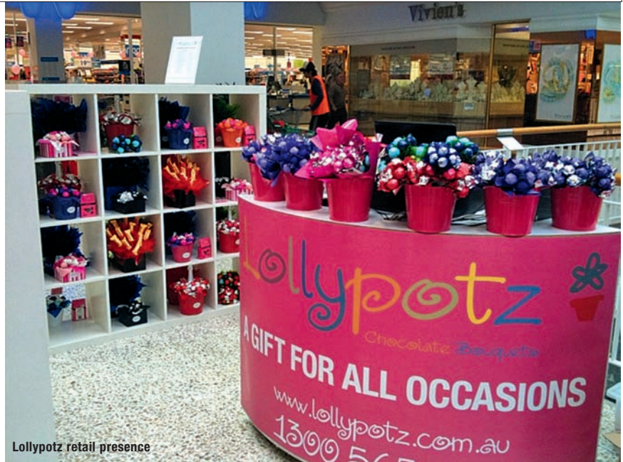
Lollypotz retail presence

love it to death but couldn't seriously consider it."